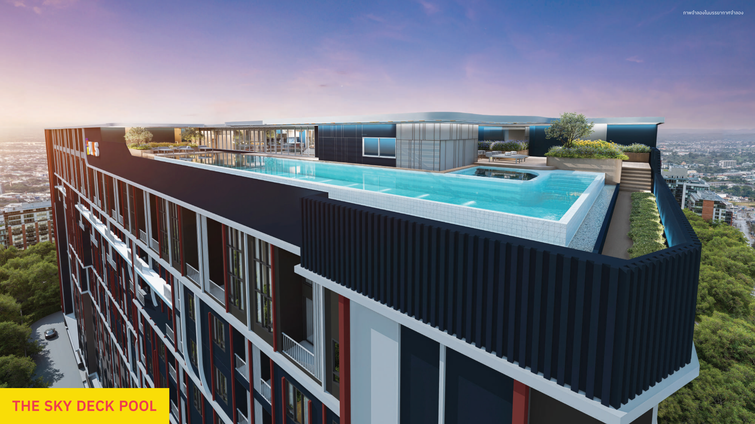
THE SKY DECK POOL